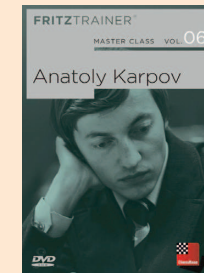
Karpov outplayed his opponents with ease; how did he manage that? Four renowned authors cast light on important aspects of Karpov’s playing style